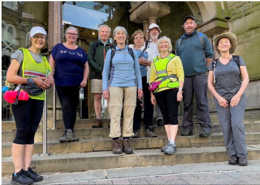
Just a few of the walkers who took part in last year's Parish Walk setting off from St Peter's