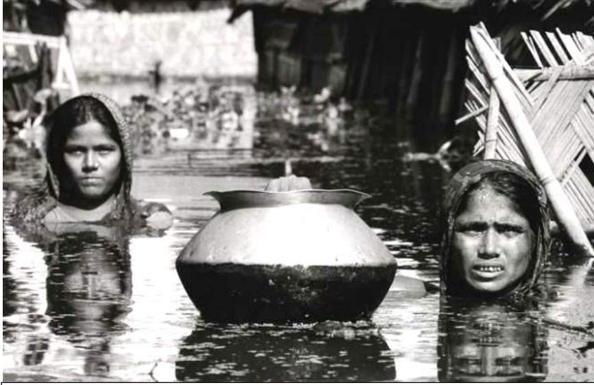
The floods in Dhaka, Bangladesh, in September 1998

For 80 years, they have provided humanitarian relief and long-term development, support for poor communities worldwide, while highlighting suffering, tackling injustice and championing people's rights.