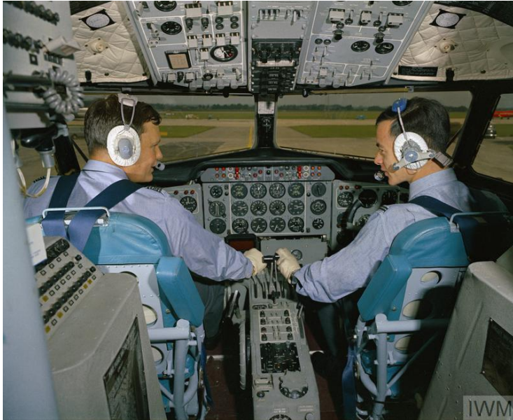
The cockpit of a Hawker Siddeley Andover C.1 of the Queen's Flight at their base at RAF Benson.