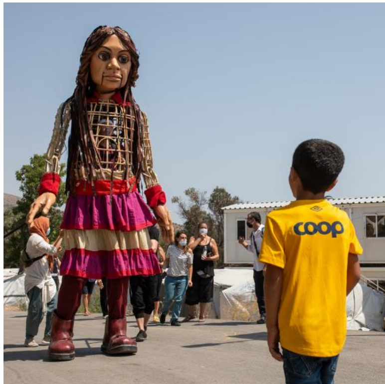
Little Amal meets a refugee boy at Breil sur Roya in the Alpes-Maritime region near the Italian border.

Little Amal, a 3.5 metre (nearly 12') tall puppet, has walked across Europe to shine a light on the stories of millions of young refugees. She has travelled through eight countries, and been welcomed by hundreds of cultural events in cities, towns and villages all along her route. Little Amal started her 5,000 mile journey in Gaziantep, Turkey, near the Syrian border on 27 th July 2021 and this week on 3 rd November she will reach her final destination - Manchester.