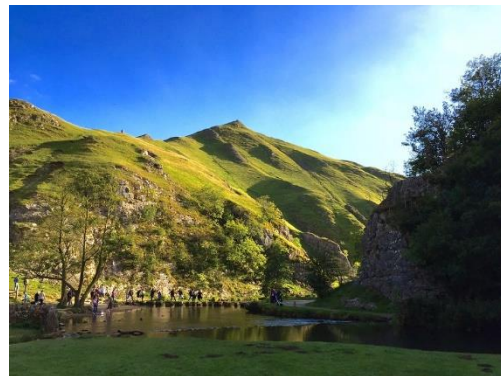
Dovedale