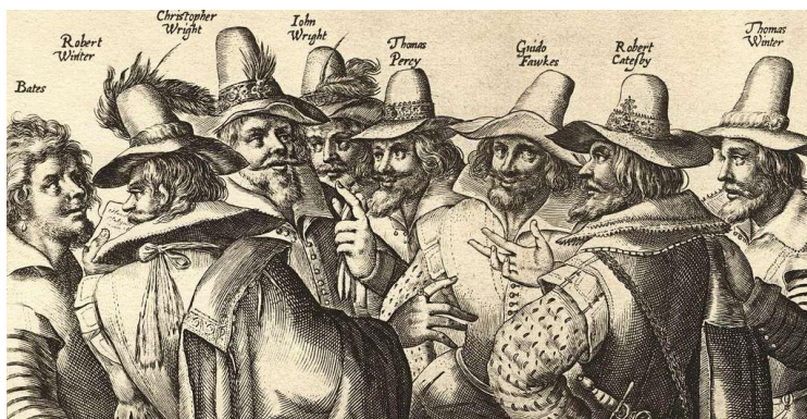
The Gunpowder Plot conspirators