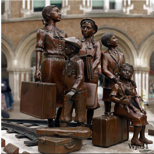
The Kindertransport monument at Liverpool Street Station, commissioned by the Association of Jewish Refugees, to pay tribute to the Britons who aided the rescue of 10,000 Jewish children in 1938 – 1939 from Nazi persecution.