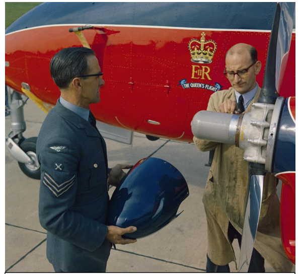
Maintaining an De Havilland Heron C3 of The Queen's Flight at RAF Benson.