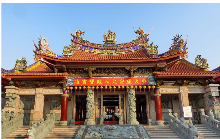
Nankunshen Daitian Temple in Tainan City, one of the most visited shrines in Taiwan.

There is a World Day of Prayer service at West Park URC at 2:00 pm on Friday 3 rd March. All are welcome.