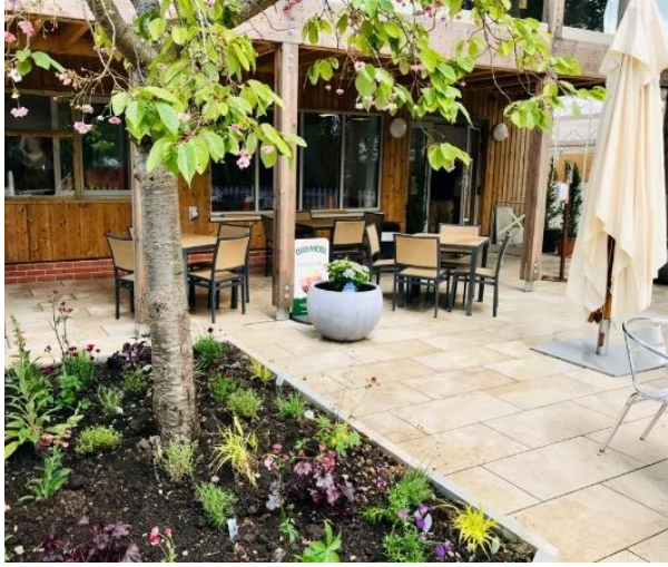
The patio of the café opened in June 2021