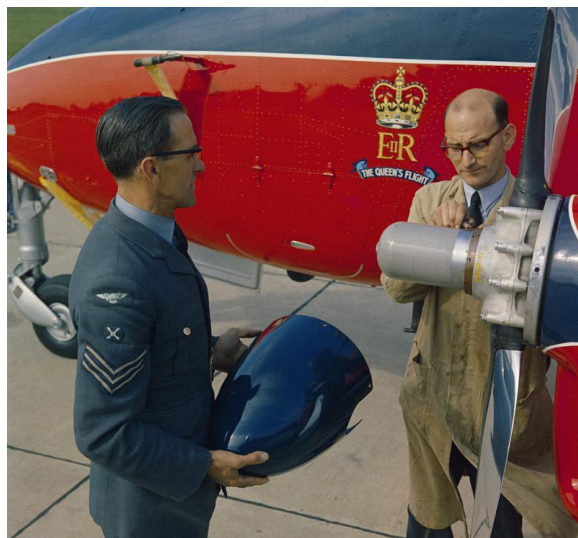
Maintaining an De Havilland Heron C3 of The Queen's Flight at RAF Benson.