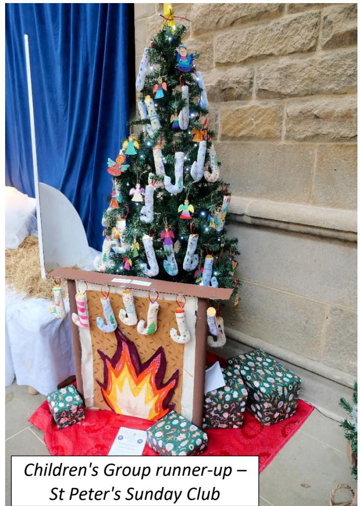
Children's Group runner-up – St Peter's Sunday Club