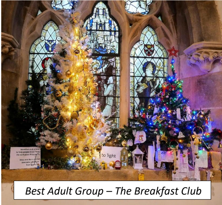
Best Adult Group – The Breakfast Club