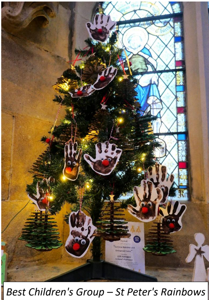
Best Children's Group – St Peter's Rainbows