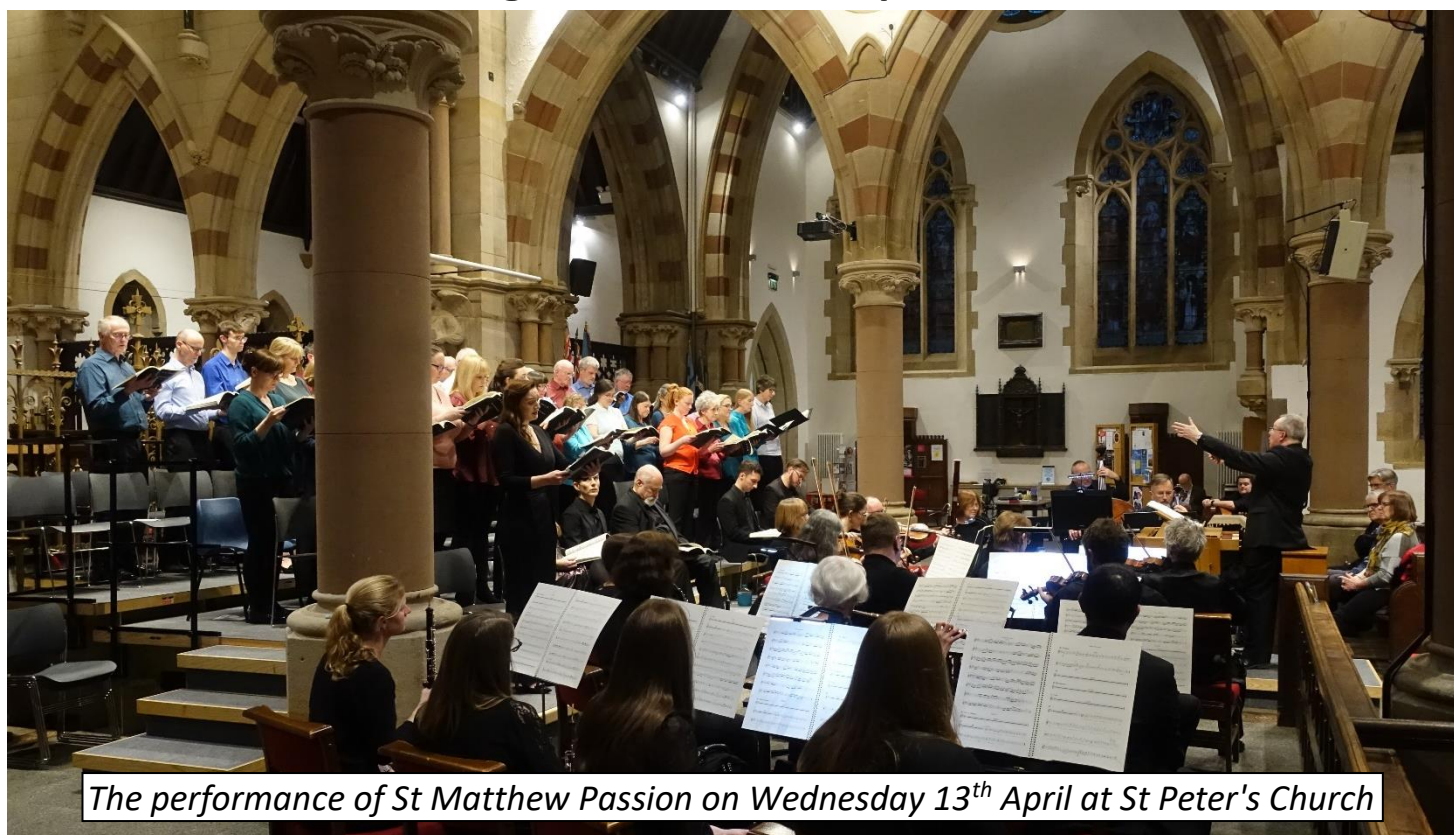
The performance of St Matthew Passion on Wednesday 13 th April at St Peter's Church