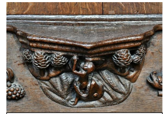
One of the 15<sup>th</sup> century misericords at Ripon Cathedral depicts the story of Jonah and the Whale.