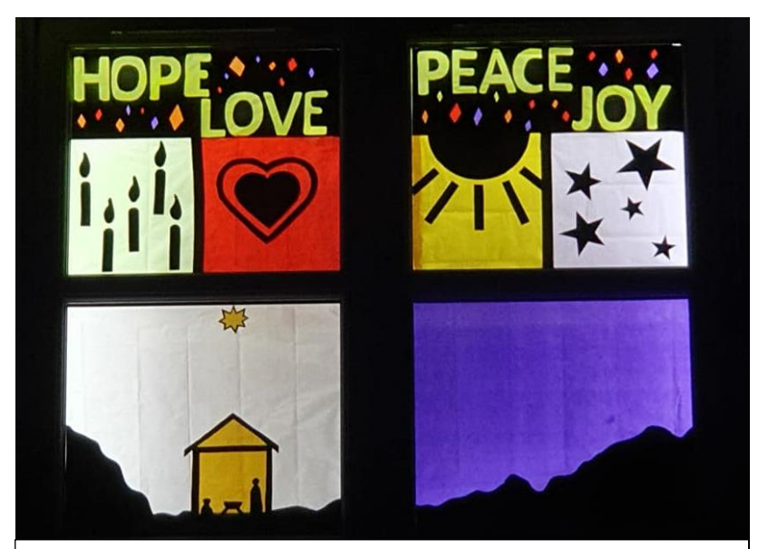
These windows are part of Harrogate Hub's The Light Shines Trail – seen at a house in Jennyfields ...

Here we are again. As the circle of the year turns, we find ourselves at a point that seems very little distant from where we were last Christmas. We are all too conscious of the fragile state of our Health Service. We see businesses continue to struggle. The Government has diminished authority. The COP26 talks have not left us with much cause for optimism in relation to the climate. And, to top it all, the Omicron variant leaves us facing a rising wave of uncertainty as we head towards the New Year.