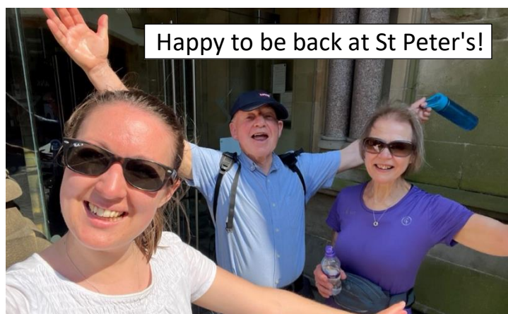
Happy to be back at St Peter's!