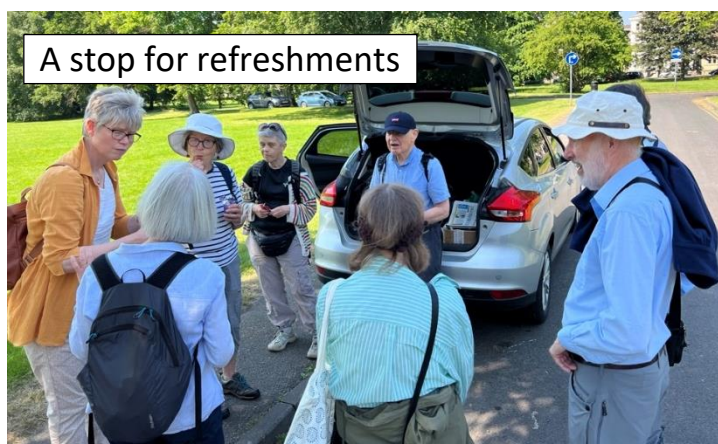
A stop for refreshments