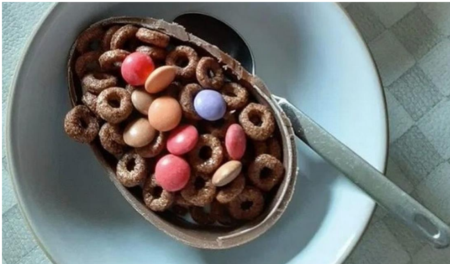
The Easter egg cereal bowl – the ultimate Easter breakfast treat?

I wonder what the results of a straw poll would be if we asked the people shopping in Harrogate, "What does Easter mean to you?".