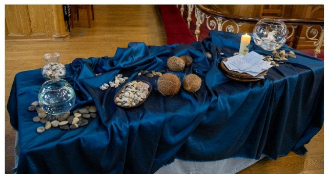
Harrogate World Day of Prayer Wesley Centre 7th March 2025