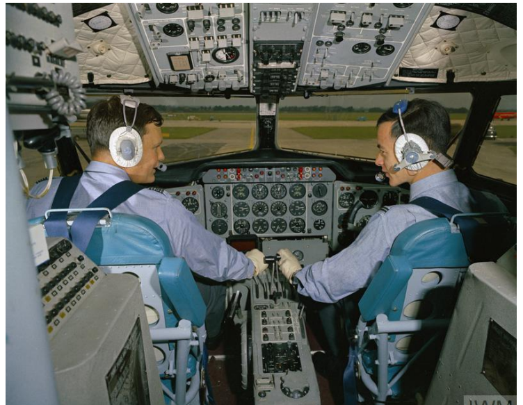
The cockpit of a Hawker Siddeley Andover C.1 of the Queen's Flight at their base at RAF Benson.