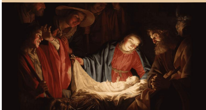
Adoration of the Shepherds by Gerard van Honthorst