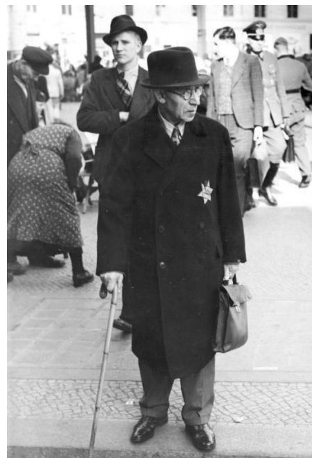
By 1941 Jews were required by law to self-identify by wearing a yellow star