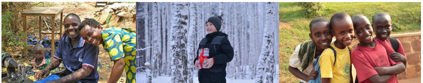
Three projects funded by Mission Possible UK (from left to right): learning new sewing skills to generate an income in Burundi; receiving a Christmas present at a shelter home in Russia; and educating children at The Star School, Rwanda.

COVID-19 has had such an impact on all these charities' incomes, but we hope that you can still help us support their valuable work! Our target is to raise at least £3,000 to share between the six charities. Please visit our JustGiving page and give as much as you can. Thank you!