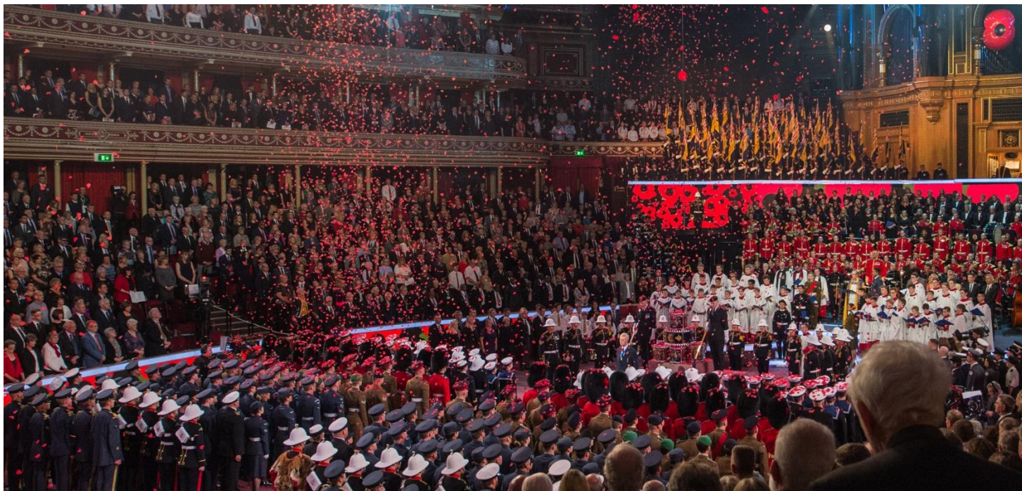
Poppies falling from the roof of the Royal Albert Hall during the Festival of Remembrance in 2015. This year's Festival is on Saturday 7 th November at 9:10 pm on BBC One.