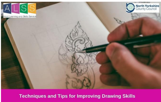
Techniques and Tips for Improving Drawing Skills