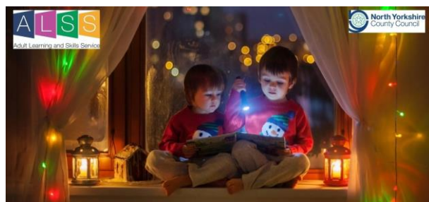
Write a Short Christmas Story for a Child

or download a Planned Giving Form from the website. THANK YOU!