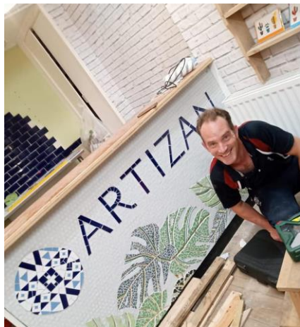
Many volunteers made the mosaic for the new shop counter

One of our partner charities Artizan International have faced many challenges this year with COVID-19 impacting both the social and therapeutic art sessions they run for disabled people in Harrogate and Leeds, and also the opening of their new shop on Oxford Street. The lockdown in countries like Ecuador and Peru has made life for their disabled artisans and projects there very difficult, shutting down the supply chain and leaving the charity without the merchandise they needed to open the new shop.