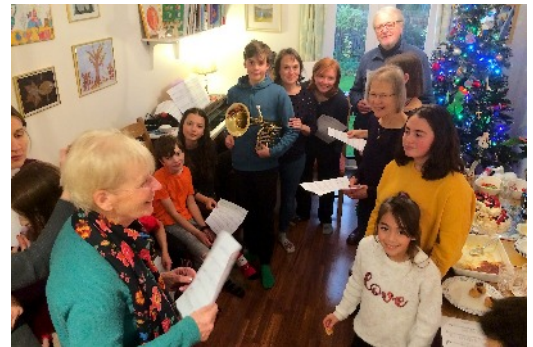
St Peter's Music Group combining their Christmas party with a rehearsal. They play at our 9:30 am Sunday service.