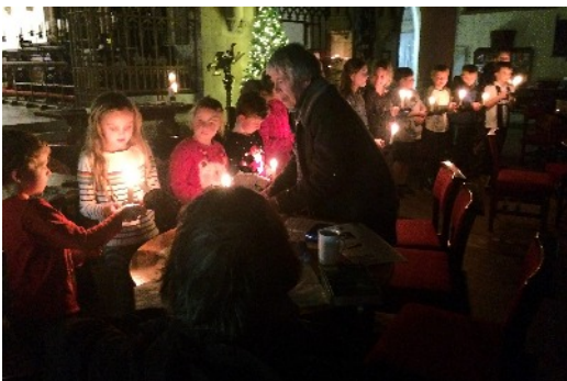
Afternoon Church holding an awe-inspiring Advent service by candlelight