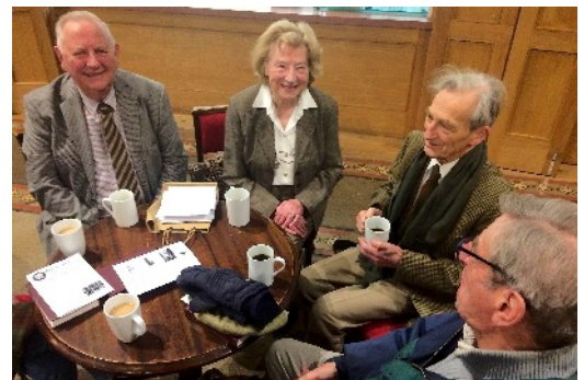
Refreshments being served after our 8:30 am Holy Communion service