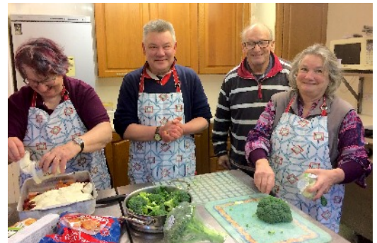
The team preparing lunch for our Sunday Lunch Club, which meets at the Wesley Centre or St Peter's each week.