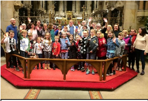
The congregation at Afternoon Church. It's on every Sunday starting at 4:15 pm. An informal service for all the family.