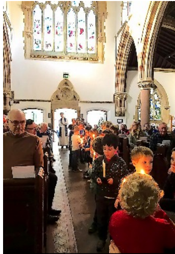
The children at 9:30 am Family Service helping the Vicar with his sermon