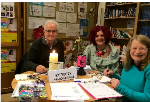
Amnesty International encouraging people to write Christmas cards to send to people suffering human rights abuses.

Last December the Diocese of Leeds encouraged us to create a photographic record of some of our activities in the run up to Christmas.