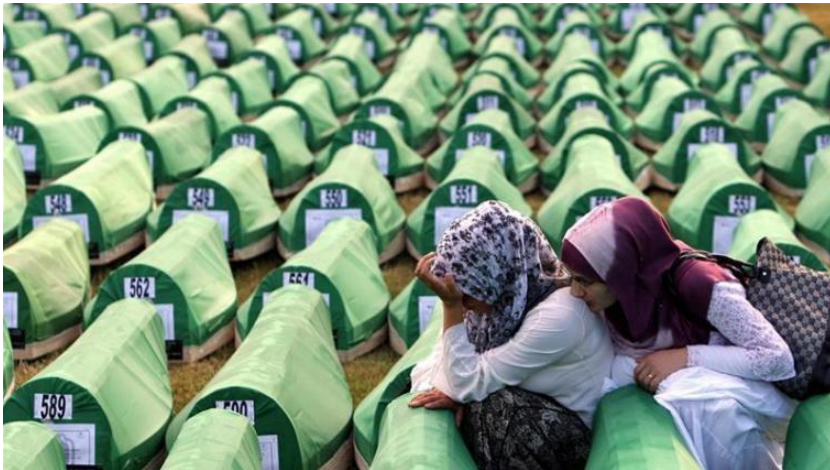
Bosnian Muslim women mourn over a coffin of a massacre victim in Srebrenica

Holocaust Memorial Day 2020 marks the 75 th anniversary of the liberation of Auschwitz on 27 th January 1945 – this is a significant milestone and is made particularly poignant by the dwindling number of survivors who are able to share their testimony. It also marks the 25 th anniversary of the genocide in Bosnia - the massacres at Srebrenica and Žepa committed by Bosnian Serb forces in 1995.