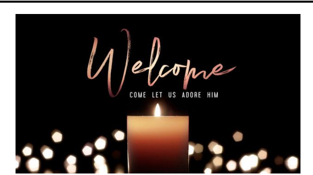
New to St Peter's? Please fill in one of the welcome cards in the pews and hand it to one of the clergy.