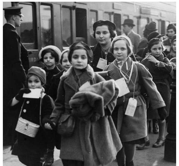
Nearly 10,000 Jewish children were rescued by the Kindertransport scheme

During the first years of Nazi rule some Jewish families, as well as others who were facing increasing persecution left their homes and fled Germany. Some fled to neighbouring countries in Europe, whilst others left for countries further away like the USA, Canada and China. Many children were sent without their parents on the Kindertransport to Britain. Not only did this mean leaving loved ones and all that was familiar, but they also had to make a new home in a different culture and language. In some cases they were not always made welcome in their new country.