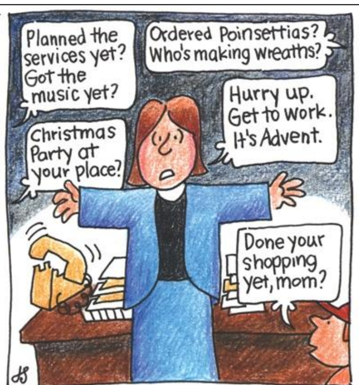
ONE MONDAY IN ADVENT