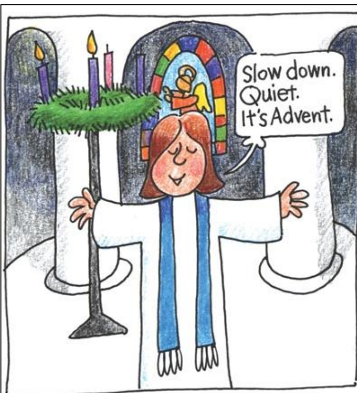
ONE SUNDAY IN ADVENT