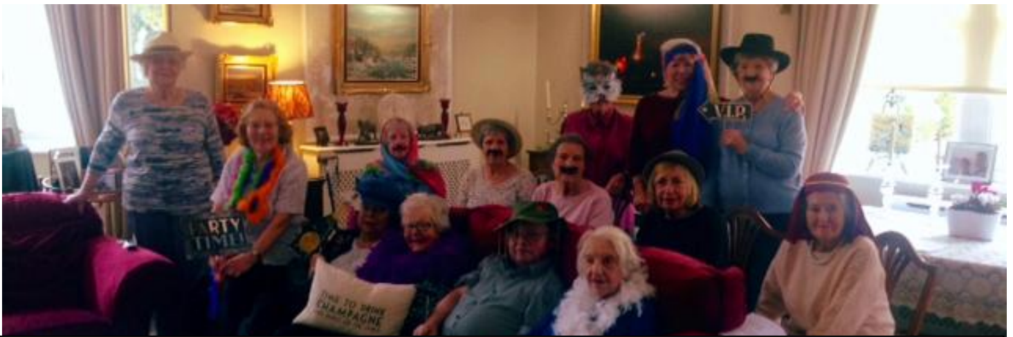
Lots of fun and laughter with a photo booth at the Afternoon Fellowship this week!