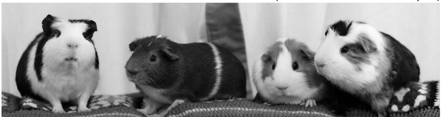
Squeak, Biscuit, Gary and Bubble lining up for their photograph!