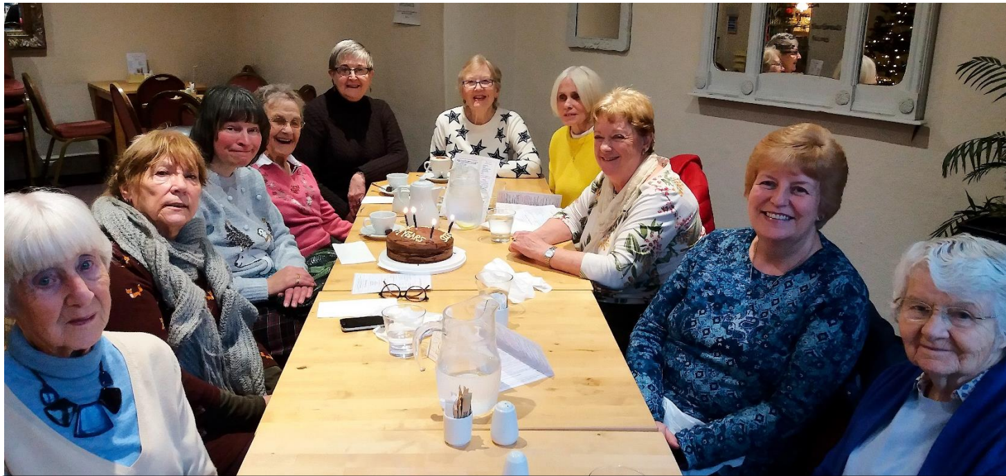
Members of St Peter's Ladies who Lunch enjoying food and fellowship at the Palm Court Café in November. They meet again in January – watch this space for details!